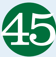
MEMBERS OF OUR CIRCLE OF FRIENDS

Bethany Congregational Church, Quincy Christ Church Quincy East Congregational Church, Milton Faith Lutheran Church, Quincy First Church of Squantum First Congregational Church, Randolph First Congregational Church of Braintree First Congregational Church of Milton First Presbyterian Church, Quincy First Trinitarian Congregational Church, Scituate Fort Square Presbyterian Church Glad Tidings Church, Quincy Hingham Congregational Church Houghs Neck Congregational Church Old South Union Church (UCC), Weymouth Parish Of St. John The Evangelist Quincy Community United Methodist Church Quincy Point Congregational Church Second Congregational Church of Cohasset Sisters of Charity of Nazareth South Congregational Church, Braintree St. John the Baptist/St. Joseph's Collaborative St. Vincent de Paul Society Sacred Heart Union Congregational Church, Quincy United First Parish, Quincy Wollaston Congregational Church