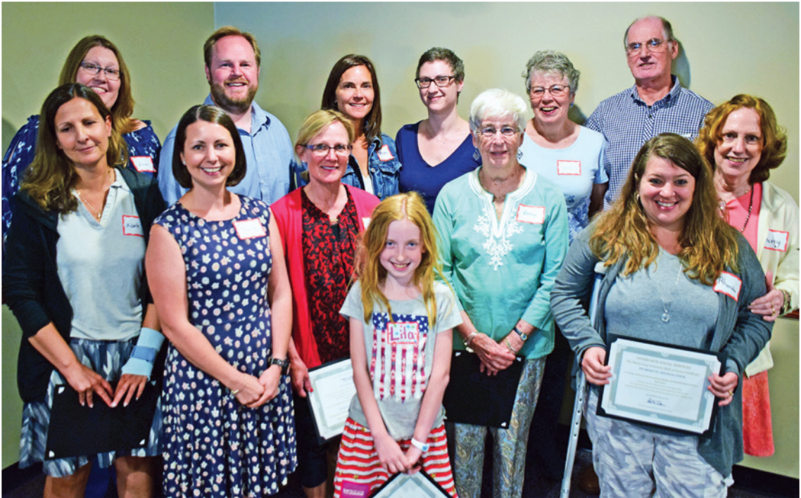
THESE VOLUNTEERS WERE INDUCTED INTO THE MATTI LANG VOLUNTEER HALL OF FAME FOR 2017.

INTERFAITH RECOGNIZES ITS 2017 HALL OF FAME INDUCTEES