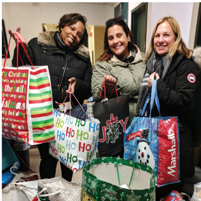
BMC HEALTHNET PLAN EMPLOYEES DELIVERING DONATED HOLIDAY GIFTS TO INTERFAITH. IN 2017, HUNDREDS OF INDIVIDUALS AND LOCAL BUSINESSES DONATED 3,000 GIFTS TO THE CHILDREN SERVED BY INTERFAITH'S HELP FOR THE HOLIDAYS PROGRAM.